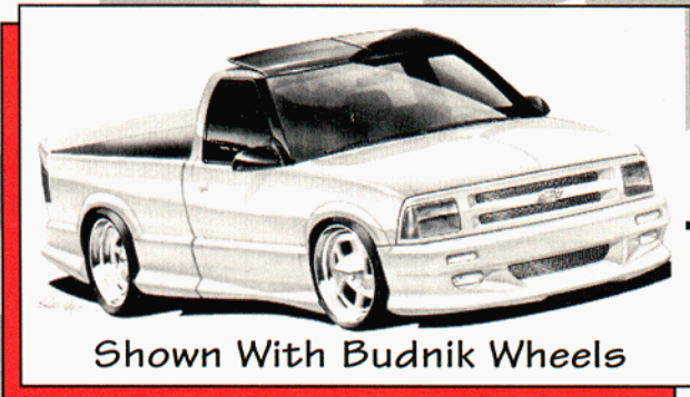
Shown With Budnik Wheels