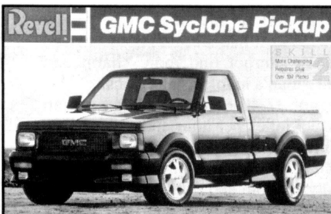
Special model has lightweight plastic body

4wd, sticks like glue. You already knew dealers are discounting GMC Sycloons, but we've found the lowest price yet: Less than $10. That's no typo. Revell Inc.'s 1/25th-scale plastic model kit hit retailers' shelves this summer. Oh, but no trade-ins accepted. ■