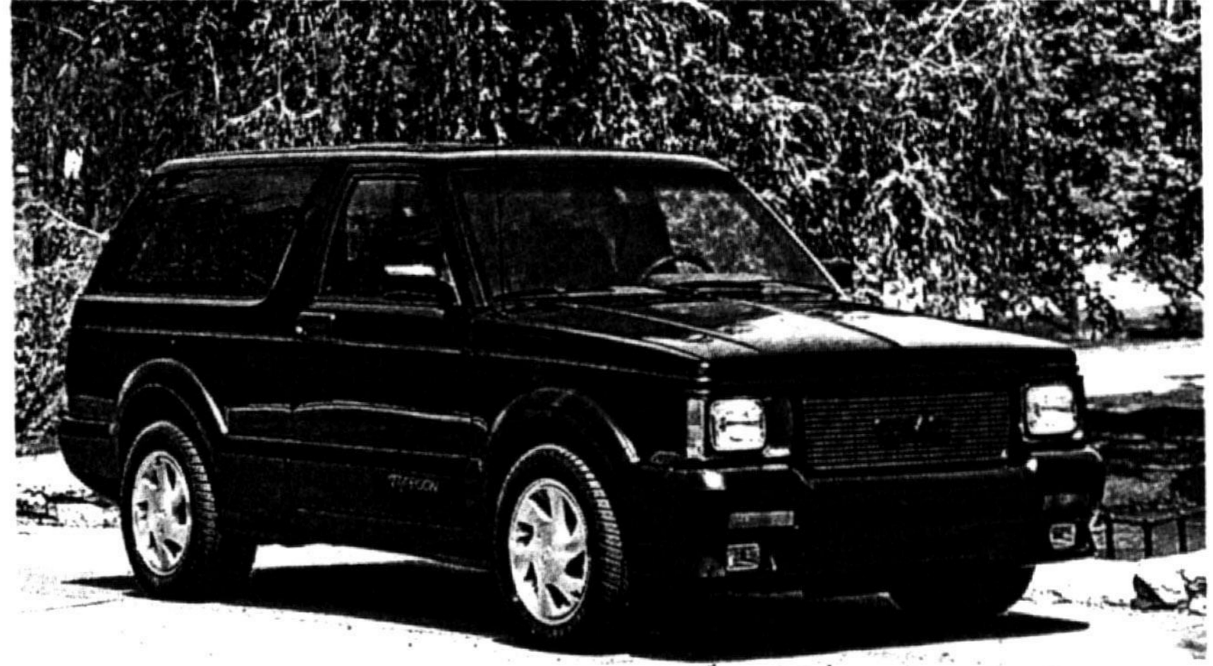
GMC is adding another high-performance truck to its line-up, the $28,000 Typhoon.

All three of these trucks come fully loaded, the only option being a CD player. And just like the Ford Model T, you can buy these trucks in any color you want as long as it's black. AT